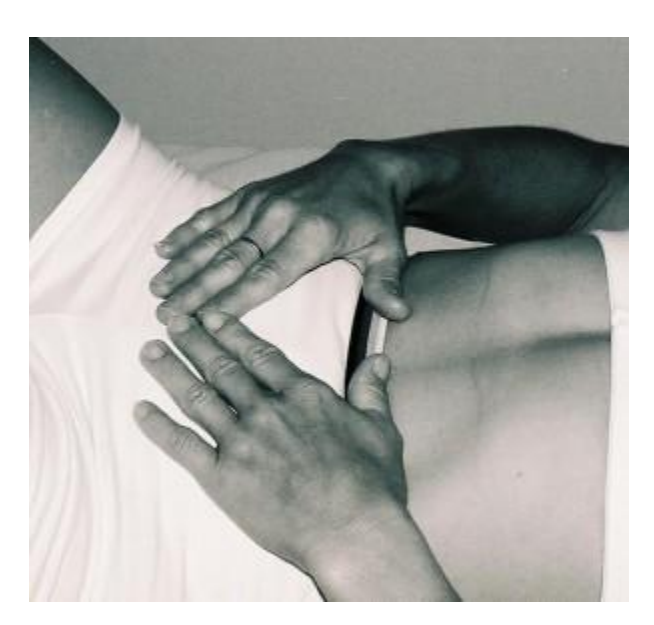
Step 6 - Exhalation

During the exhalation the hands follow the belly and at the end of the exhalation, the hands press gently downward and upward toward the chest.