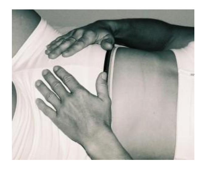
Step 6 - Inhalation

During the exhalation the hands follow the belly and at the end of the exhalation, the hands press gently downward and upward toward the chest.